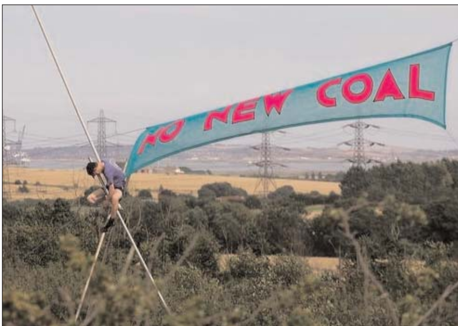
Protester at the August 2008 climate camp, near Kingsnorth power station, Kent, UK

DTE's one-hour workshop also drew attention to regions such as Papua, which are 'cursed' with rich natural resources, and therefore attract predatory investors. Evidence of this was presented in the World Bank's 2006 report which revealed that, despite its wealth of natural resources, more than 40% of Papua's population - or more than double the national average - live below the poverty line. The 10% growth enjoyed by the region since the mid 1990s and the increased revenue since Special Autonomy was introduced in 2002 does not appear to have 'trickled down' very far. (see DTE 68:7). Human Rights groups have also put