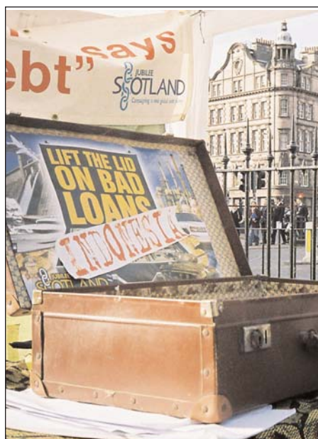
Anti-debt campaign

Our vigil resulted in a meeting with Darling, at which he stressed that the UK debt policy "had not changed one jot" from how it was before. We interpreted this as meaning that the UK Government still had an open and positive attitude towards proposals for debt cancellation; but given that we were in fact trying to /change /that policy, to