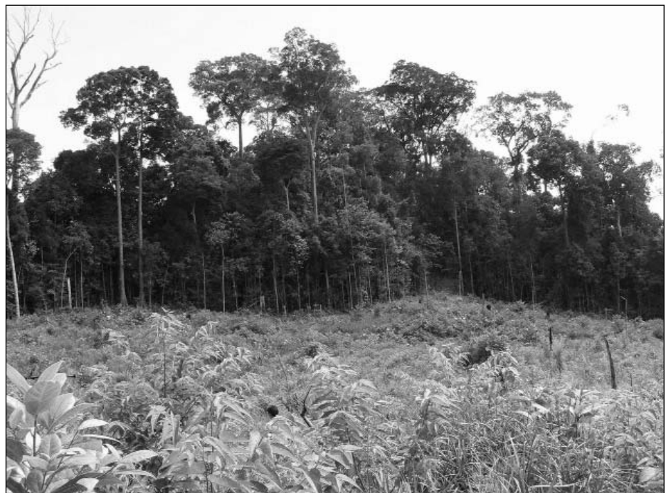
Umai and Kampong Endor Kerja areas, Sungai Utik

management - by combining principles of conservation with a community logging initiative. This initiative requires high quality natural/forest resources, indigenous communities who have maintained their forest resources management values oriented towards conservation, plus the potential and capacity of supporting organisations. By the end of this community logging project, hopefully the production model of community-based forest management applied in Sungai Utik will be recognised by the market through the Indonesia Ecolabeling Institute's forest management certification scheme.♦