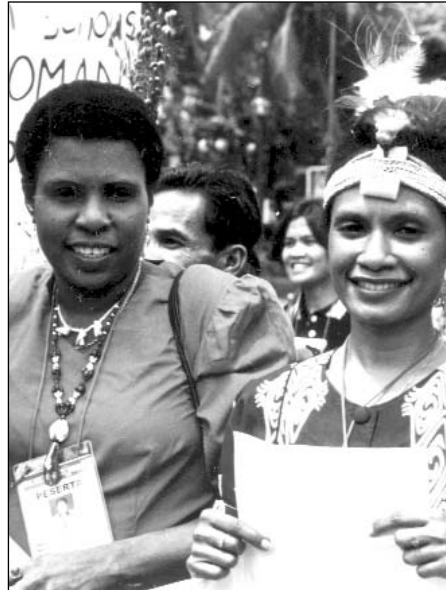
Indigenous women at AMAN Congress

virtue of that right "they freely determine, their political status and freely pursue their economic, social and cultural development".