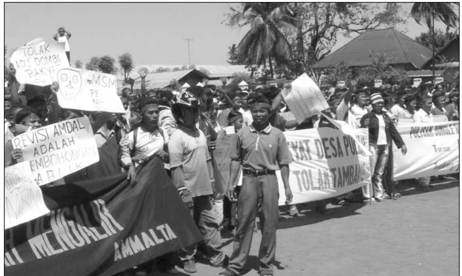
Protests against MSM, North Sulawesi

The local communities are desperate to save their environment and way of life. So far, they have funded all their lobbying themselves through their organisation, AMMALTA (The Alliance Against Mining Waste), even though its members are mainly ordinary farmers and fisherfolk (see