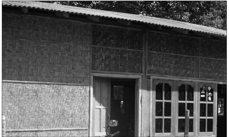
New house built of bamboo panels

The data collection has not been carried out by the officials who were supposed to do it. Instead there has been a tendency to pass this matter to the people themselves, with no guidance, and call it 'self-assessment'. As a result, the distribution of aid to cover living costs is different from one area to another. According to the mechanism used, living cost assistance is allocated on a house by house basis, at the same time as damage verification. If the damage is less than 25%, or