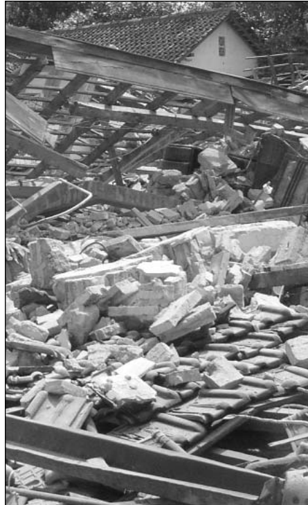
Devastation in Java

Two days after the disaster, I got involved in emergency response work as a volunteer in an NGO in Yogyakarta. I helped