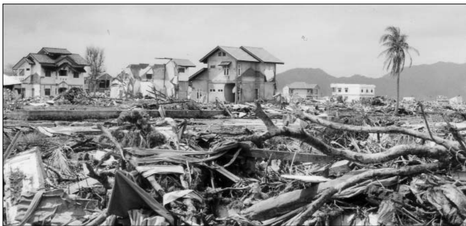
Rubble-strewn scene, Banda Aceh, January 2005

The situation was chaotic in the first few weeks. Villagers from islands off the north and west coast were desperate to get to the mainland, not realising that conditions there were even worse than those they left. Relatives from all over Aceh, Medan and as far