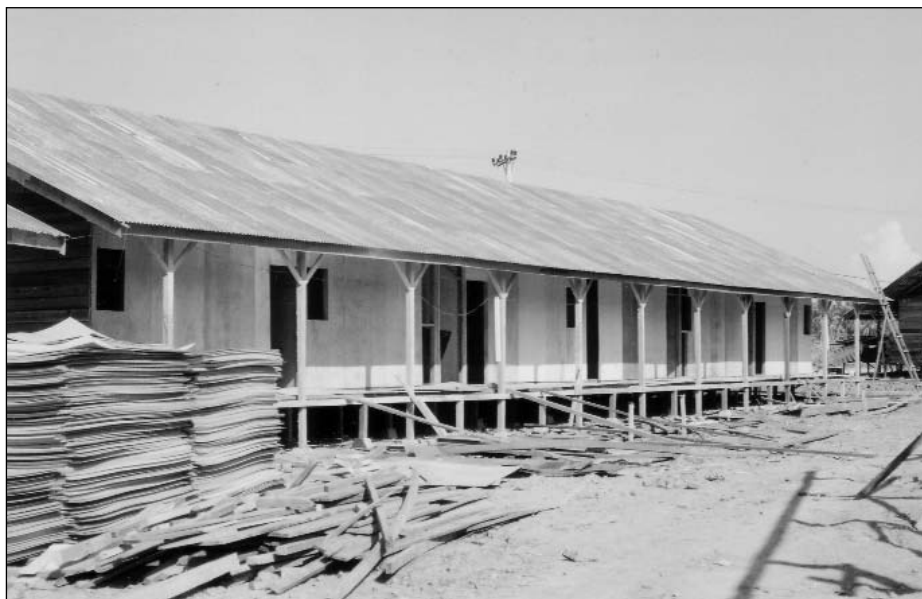
Top-down planning: barrack-style shelters, Lambaro, Aceh Besar, February 2005.

According to HRW and HRF, at least a third of people displaced by the tsunami were living in spontaneous camps in early February, while others were staying in public buildings or with friends or relatives. The government promised a monthly allowance for people living with host families, but no clear commitment had emerged to support those who chose to return to their places of origin immediately. The organisations raised concerns that the government was registering displaced people