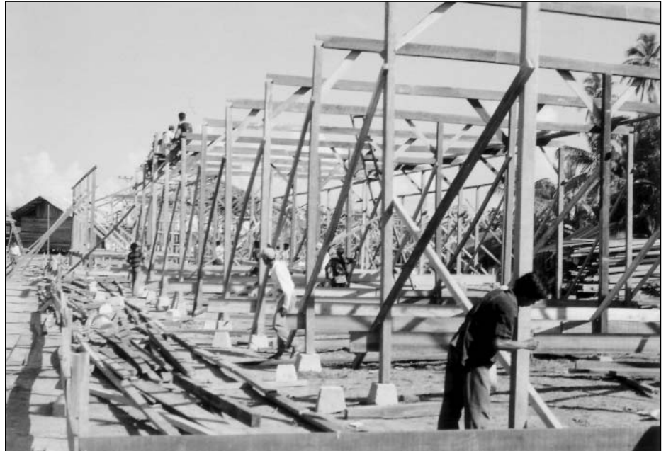
Construction work on semi-permanent barracks, Aceh, February 2005

It shows many of the same elements as the transmigration programmes of the 1980s. NGOs in Aceh and Jakarta suspect that the whole programme is designed to exert tighter control over Aceh's people.