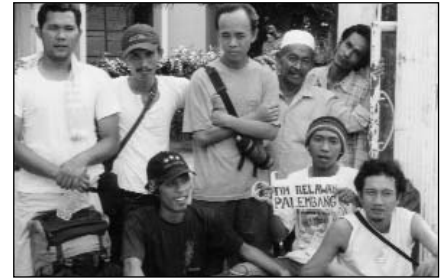
Volunteers from Palembang, January 2005, in Aceh

office: 59 Athenlay Rd, London SE15 3EN, England, email: dte@gn.apc.org tel/fax: +44 16977 46266 website: http://dte.gn.apc.org