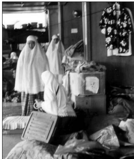
Reconstruction will work best if affected communities decide the direction

Civil society organisations involved in discussions about reconstruction have