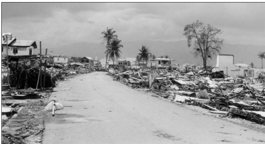
Destroyed homes, Banda Aceh, January 2005