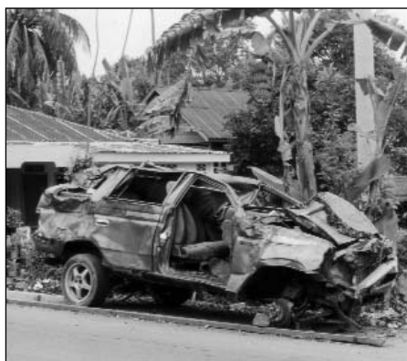
Tsunami-damaged car, Banda Aceh (DTE)

As we came in to land, everyone stood on the canvas seats, clutching onto the webbing