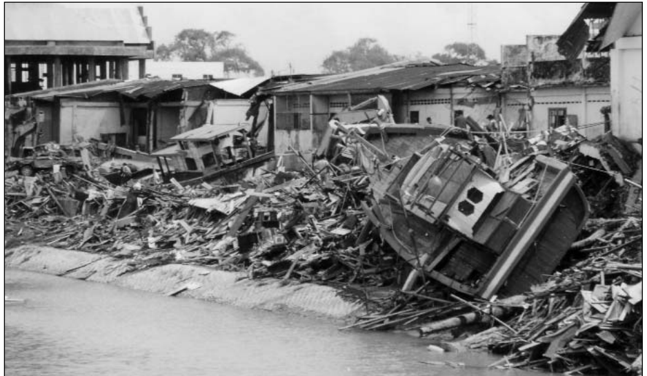
Fishing boats washed inland, Banda Aceh, January 2005

Some fisherfolk are so traumatised that they cannot contemplate going back to their former way of life. But many more are desperate to return. They fear the loss of their identity and culture as fisherfolk and