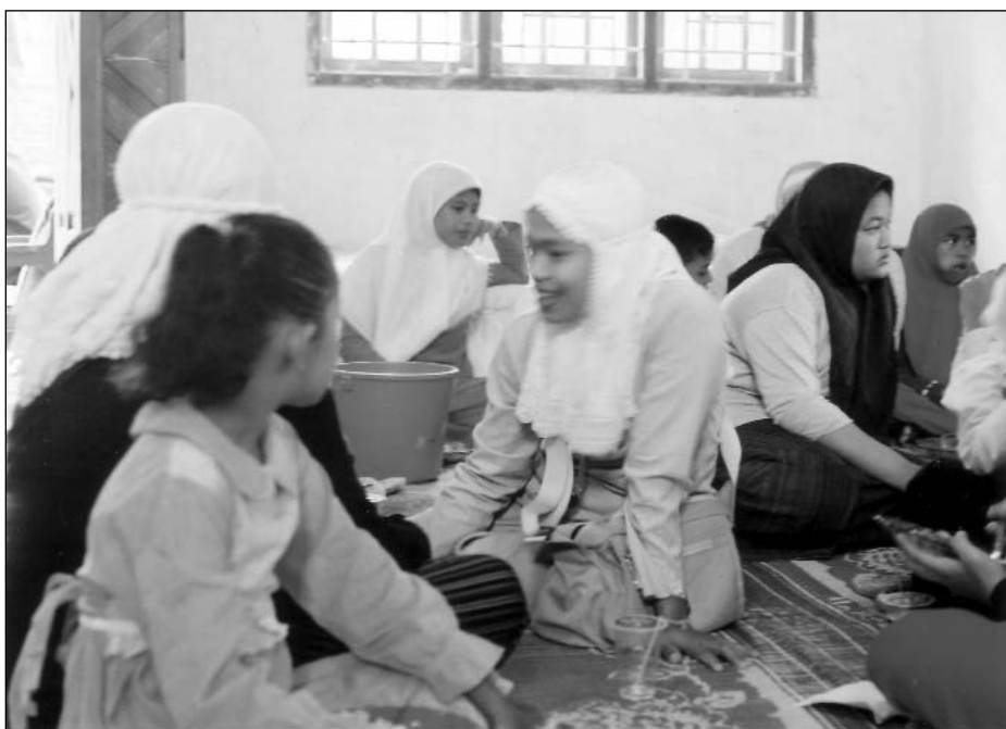
Women at a lunch to commemorate civil society organisation members who were lost (DTE)

Teenage girls are particularly at risk. Many of the larger aid agencies, such as UNICEF, only provide support for children up to the age of sixteen. Older girls who have lost one or both parents have little chance of continuing at school or getting skills training. Trafficking of young women to Java, Malaysia or the Middle East for the sex trade or as domestic servants was recognised as a problem in Aceh before the disaster. Sale into early marriage is another risk, given the high proportion of single and widowed men. There are fears that unscrupulous procurement agents may be preying on girls still traumatised by the disaster who have no-one to protect them.