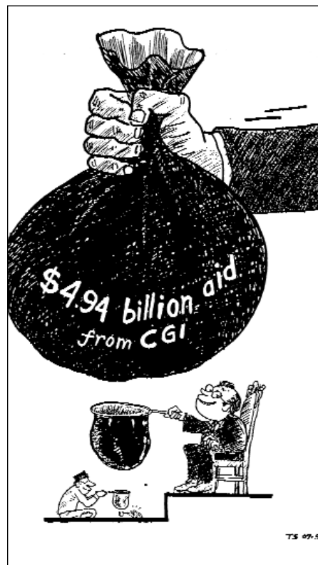
Jakarta Post cartoon from a previous year's CGI loan meeting

In the run up to the Jakarta aid summit, the idea of debt relief for tsunami-affected countries had already been raised by European countries, including Britain and Germany. The Financial Times reported that British Chancellor Gordon Brown would back calls to write off some of the debts of the worst affected countries and that Britain wanted to announce a deal on debt relief at